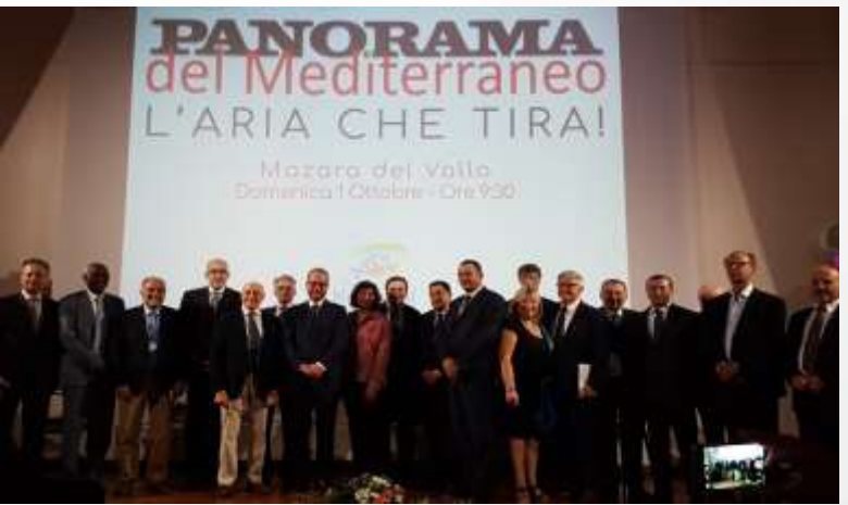
Some photos of Blue Sea Land 2017