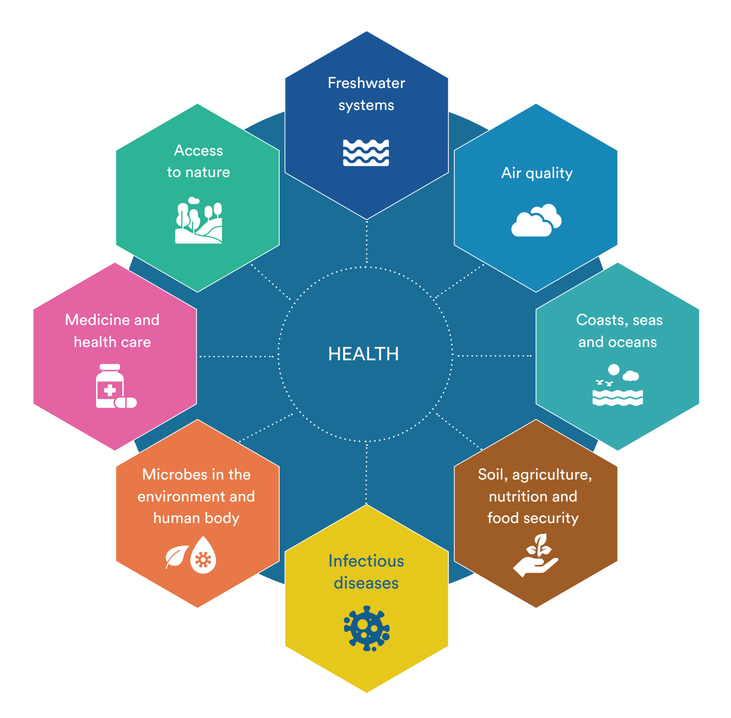
Fig. 2. Overview of interconnections between nature and health

The following sections provide an overview of the interconnections (Fig. 2) between nature and health through consideration of key issues discussed in the 2015 review by WHO/Convention on Biological Diversity (2) .