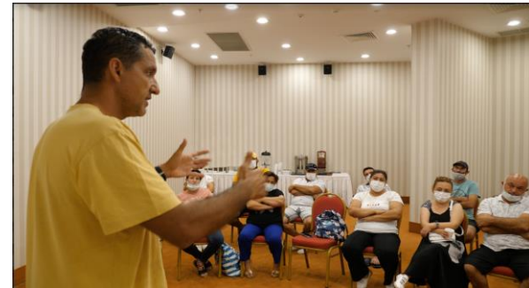
Workshop in Turkey on participative management and cooperative building during an exchange visit for fishermen and fisherwomen in July 2021