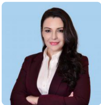
Mrs. Belinda BALLUKU, Deputy Prime Minister and Minister of Infrastructure and Energy;

Mrs. Belinda Balluku is Minister of Infrastructure and Energy as of January 2019 and Deputy Prime Minister as August 2022. Prior to being appointed as Minister of Infrastructure and Energy, she was the General