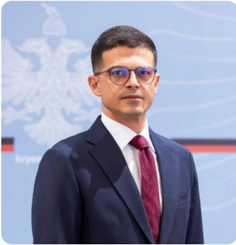
Mr. Pirro VENGU, Minister of Defense

Mr. Pirro Vengu holds the position of Defence Minister of the Republic of Albania, since July 2024.